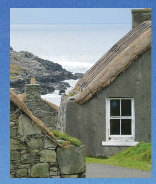
Gearannan black hous

Deadline for submissions 12 midnight on Friday 1<sup>st</sup> December 2017.